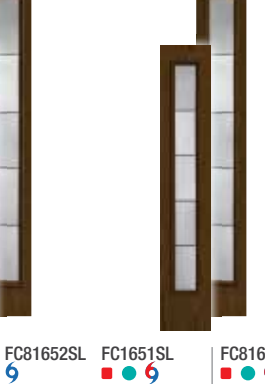
FC81651SL 9 12"x 8'0" 14"x 6'8" $ 14"x 8'0"