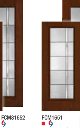
2'8"x 8'0" 2'10"x 8'0"